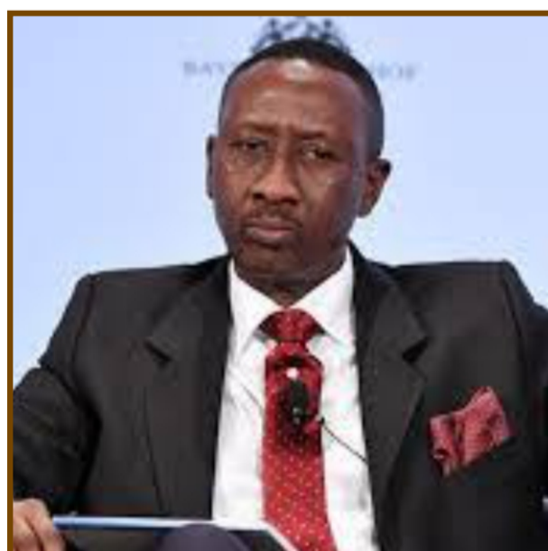
Mohammed Babagana Monguno National Security Adviser to President Muhammadu Buhari

The Federal Government has inaugurated a multi-stakeholder committee to review the National Cybersecurity Policy and Strategy (NCPS) 2014, citing associated threats dynamics within the cyberspace.