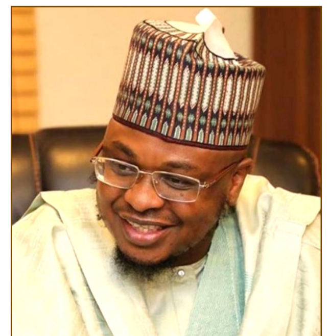
Dr. Isa Ali Pantami Minister of Communication and Digital Economy

"We want to provide conducive environment for new investors to come into the ICT sector in order to create a healthy competition in order to bring down the price of data by 40 percent by 2025.